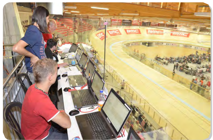
Timing room during a Cycling Track event

All the information contained in this document can be modified without warning. Swiss Timing LTD cannot be made responsible for any errors contained in this document or for any damage secondary or consequent (including the loss of profits) arising from the supplying, performance or use of this product, whether it be on the base of a guarantee, a contract or any other legal ground.